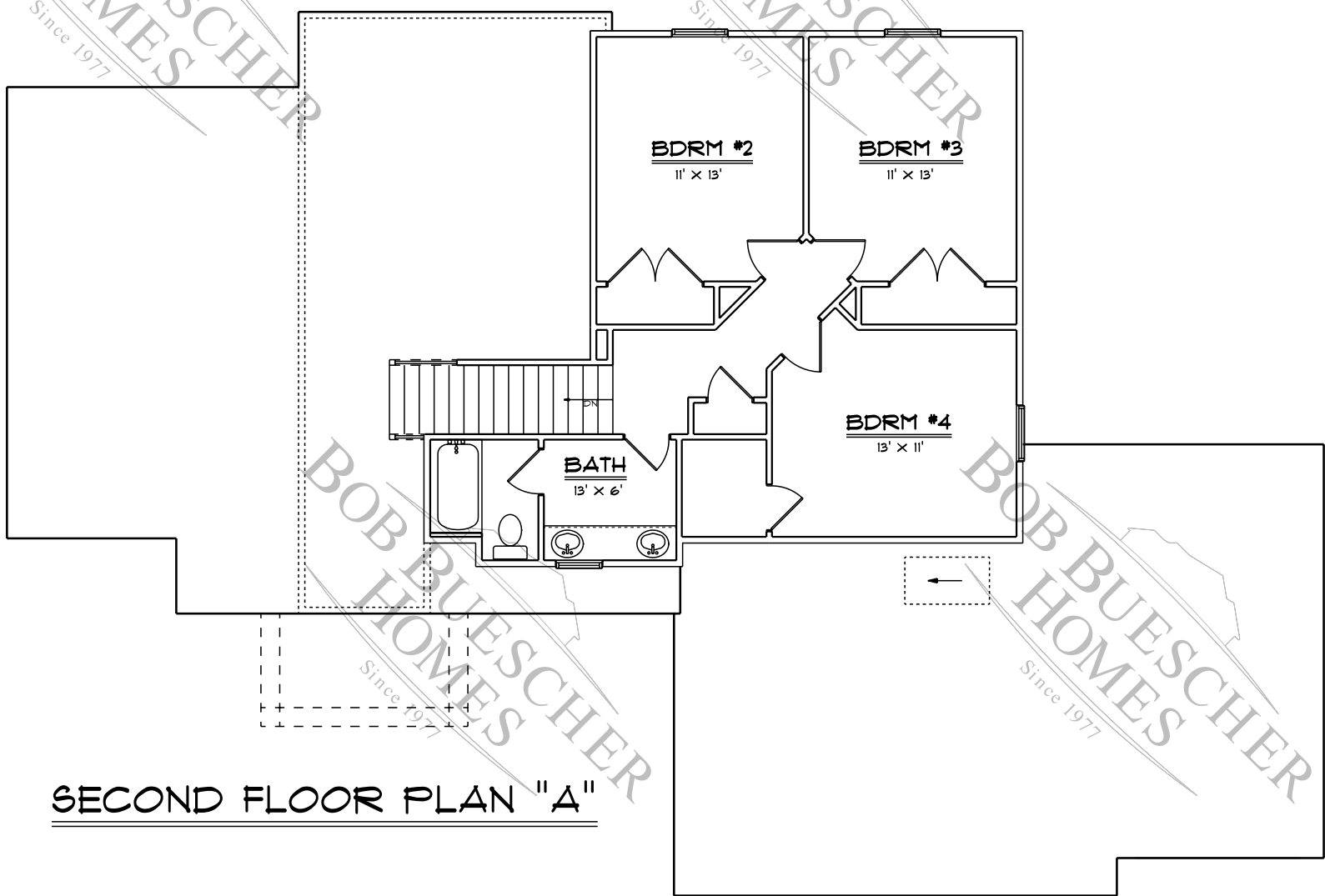
SECOND FLOOR PLAN "A"